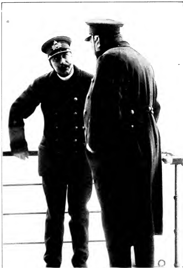
"OUR FUTURE LIES UPON THE WATER" THE EMPEROR ON SHIPBOARD IN THE AUTUMN OF 1898